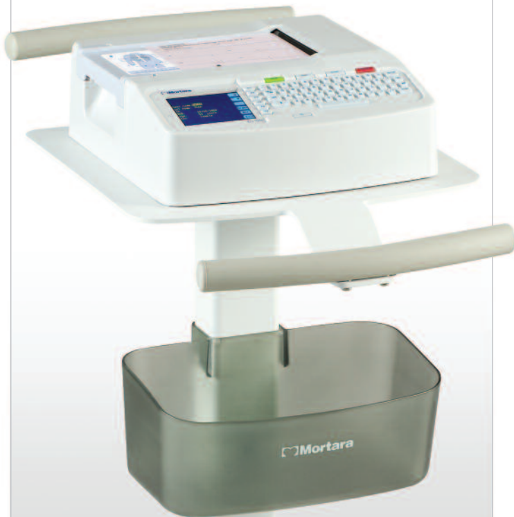
12-LEAD resting electrocardiograph

Experience the benefits of bidirectional communication via internal modem, LAN, wireless LAN, or GPRS mobile with Mortara's E-Scribe™ and Athena products, as well as third party EMR, HIS, and PACS systems via XML, PDF, UNIPRO32, and DICOM®32.