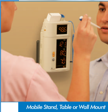
Mobile Stand, Table or Wall Mount