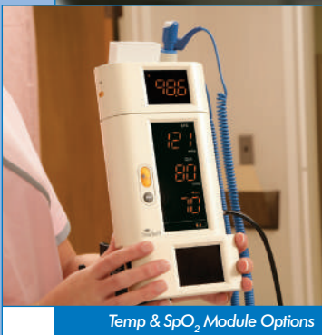
Temp & SpO 2 Module Options