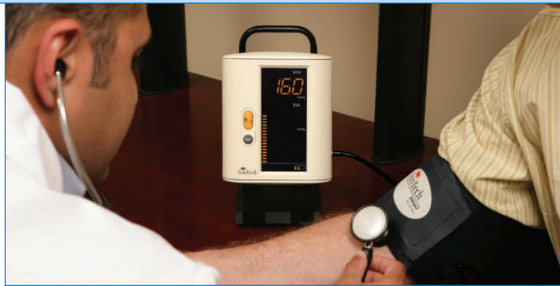
SunTech® 247™ BP module in Manual SphygMode